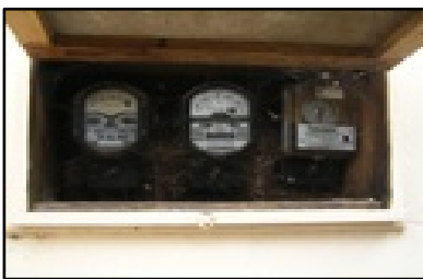
Sample of photos required